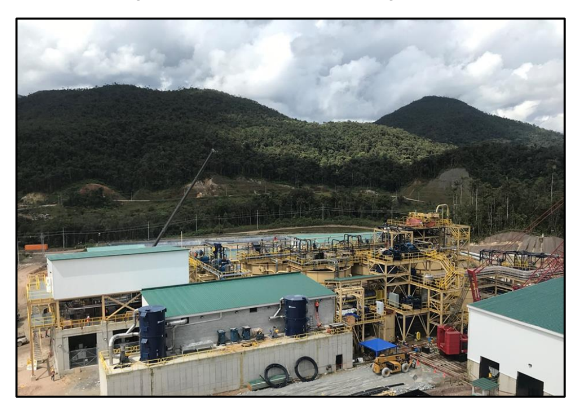
Figure 2. Carbon-in-leach circuit and gold room