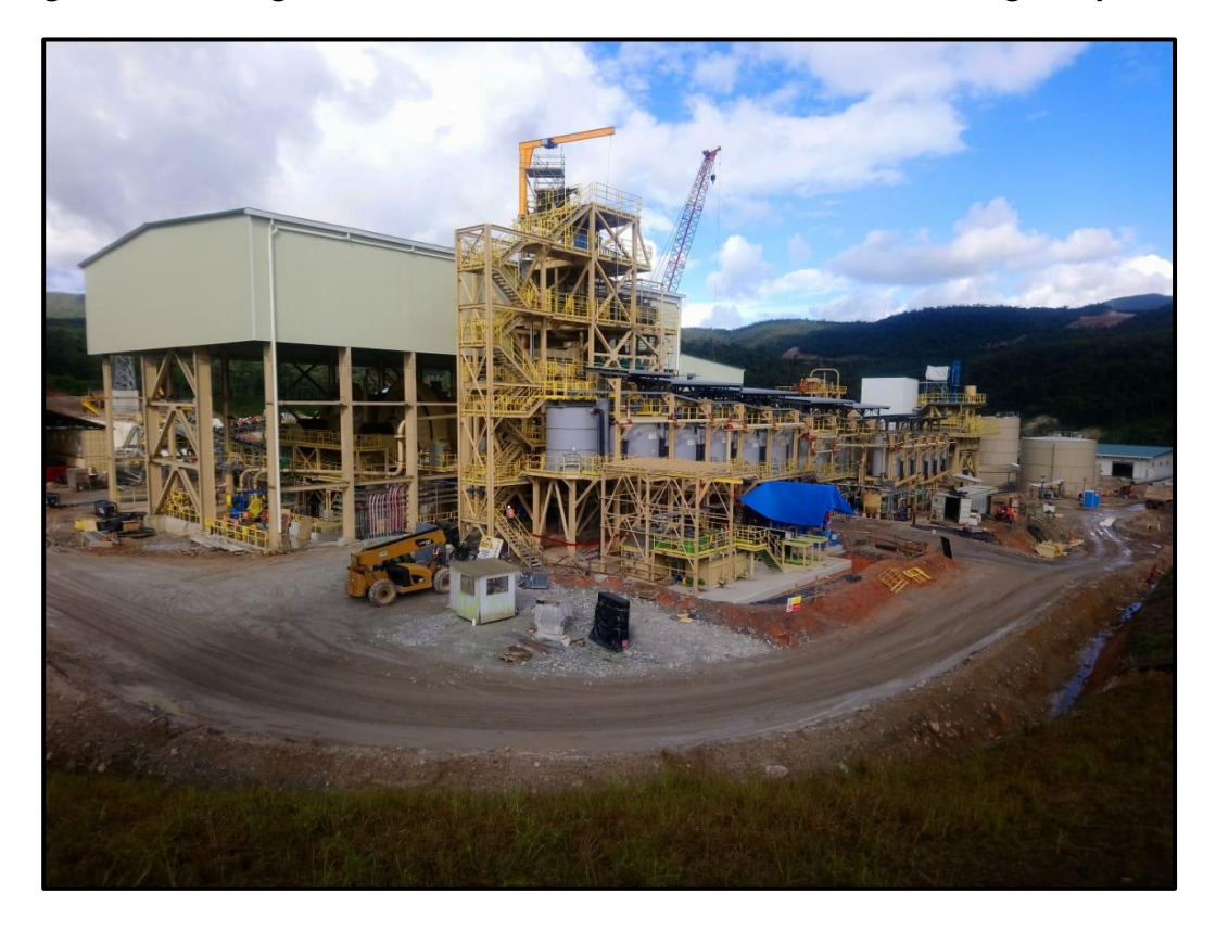
Figure 1. Grinding circuit and flotation circuit construction nearing completion